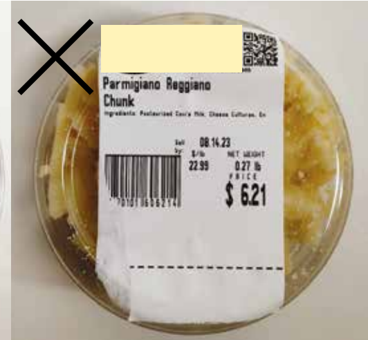
Incorrect ingredient: pasteurized milk

Incorrect name Incorrect ingredients: presence of cellulose